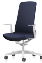
Swivel chair, upholstered backrest

PURE IS3 fits perfectly into any environment. Its clean-cut design and the large choice of colours and materials leave you free to customise your chair. The collection offers four swivel chair models: a mesh or upholstered backrest in either white or black. A variety of materials and colours are available to choose from. The Smart Spring, chair column and optional armrests are available in either all-white or all-black for all models. Choose between fixed T-armrests or 3D T-armrests; the fixed T-armrest impresses with its slim design, while the 3D T-armrest is exceptionally functional and height-, width- and depth-adjustable.