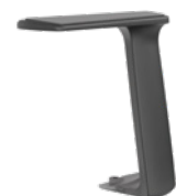
Fixed T-armrest, black