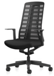
Swivel chair, mesh-covered backrest