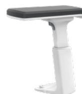
3D T-armrest, white