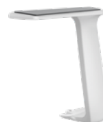
Fixed T-armrest, white

White design: All plastic parts and Smart Spring including backrest inlay, except for castors and armrest cover (these are always black).