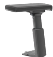
3D T-armrest, black